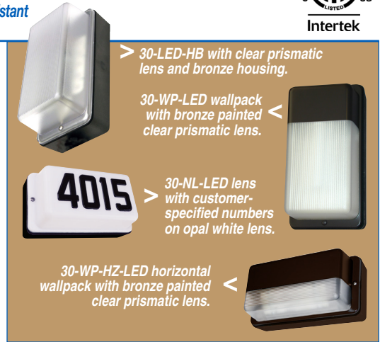
> 30-LED-HB with clear prismatic lens and bronze housing.

LEDs will not break, unlike conventional lamps, if luminaire is dropped.