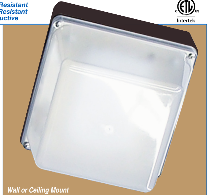
Wall or Ceiling Mount

Luminaire Type _____ Catalog Number _____ Product Code _____ Job Name _____ Approval _____