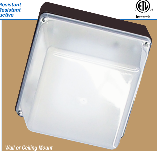
Wall or Ceiling Mount

Luminaire Type _____ Catalog Number _____ Product Code _____ Job Name _____ Approval _____