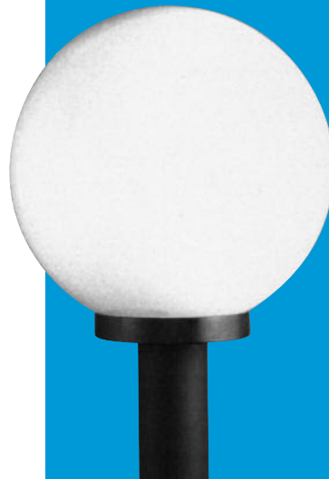
1400-OW shown on post.